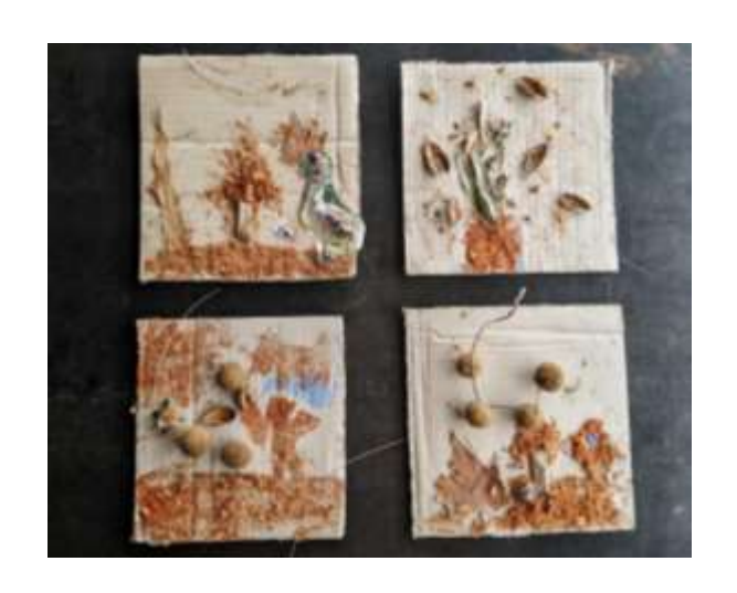
Artwork by Chrysalis kids at the Nursery