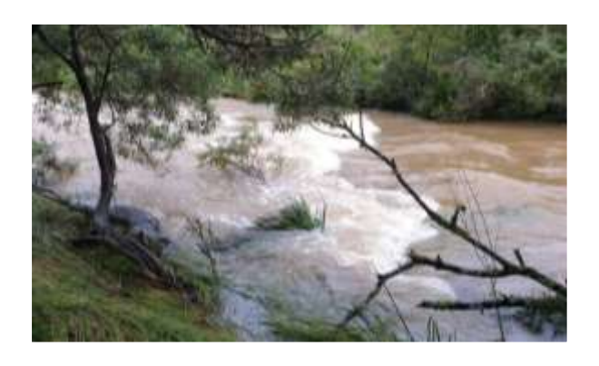
Rocky Ck in flood

Rocky Ck Regen is on Monday mornings. Contact dandarrga@gmail.com